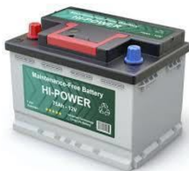
Figure 2 Typical Battery

Lead battery is a rechargeable battery that supplies as well store electric energy. Traditionally, this is used for starting, lighting, ignition, and its main purpose is to start the engine.