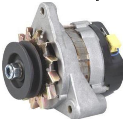
Figure 3 Typical dynamo generators

Figure 3 show the dynamo generator (alternator) that is used in this model to charge the battery.