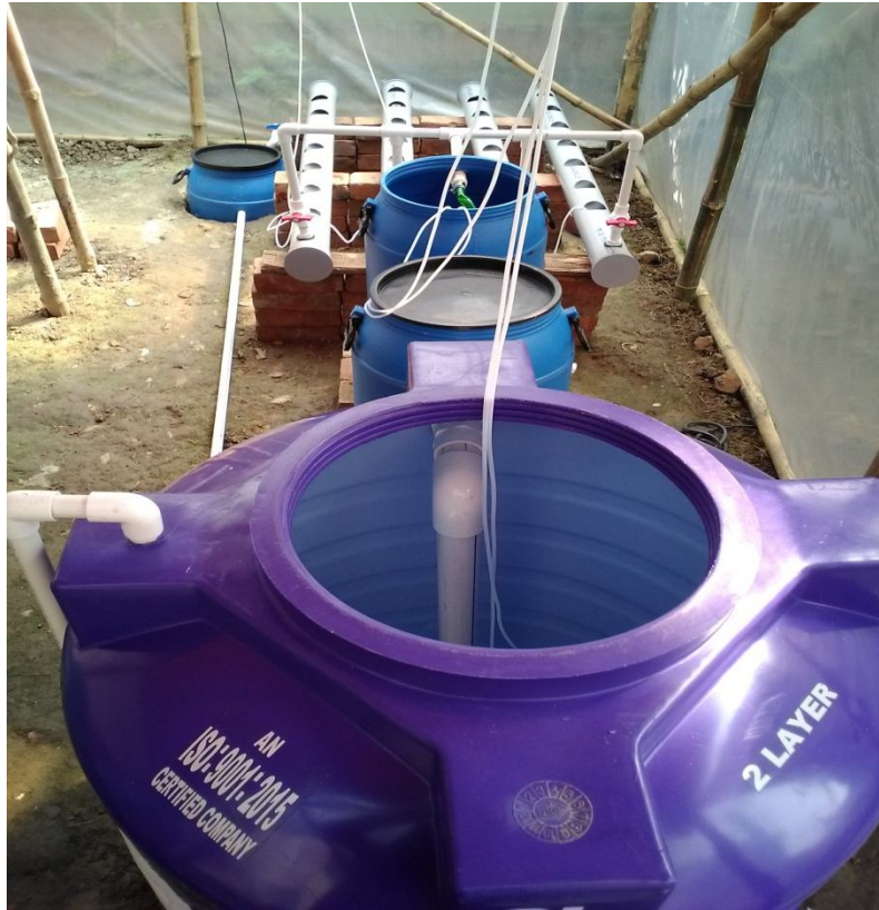
Fig.2 is the Building system of nutrient film aquaponics system