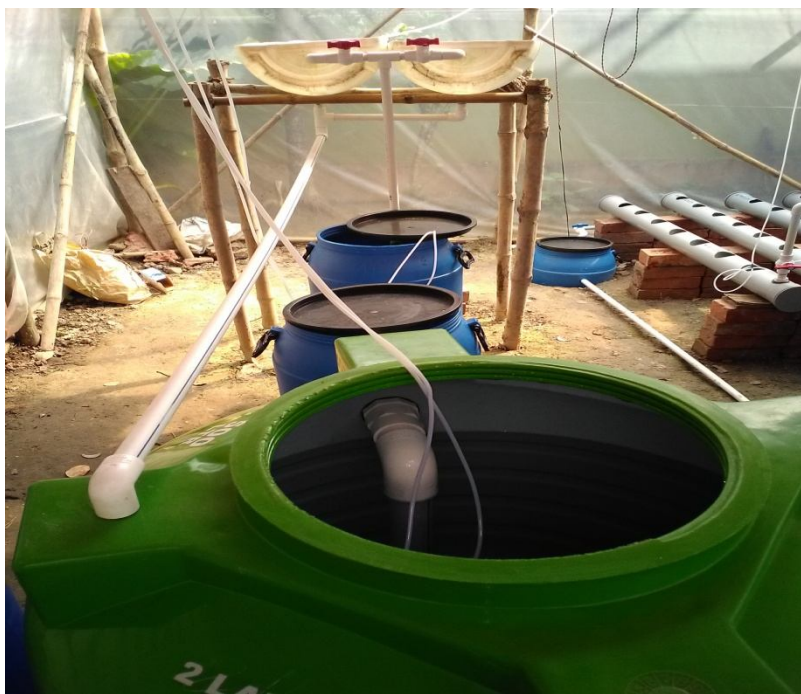
Fig. 4 is the building system of floating raft aquaponics system