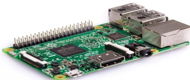
Fig. 2. Raspberry Pi 3