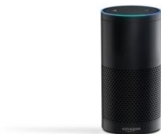
Fig.3. Amazon Echo