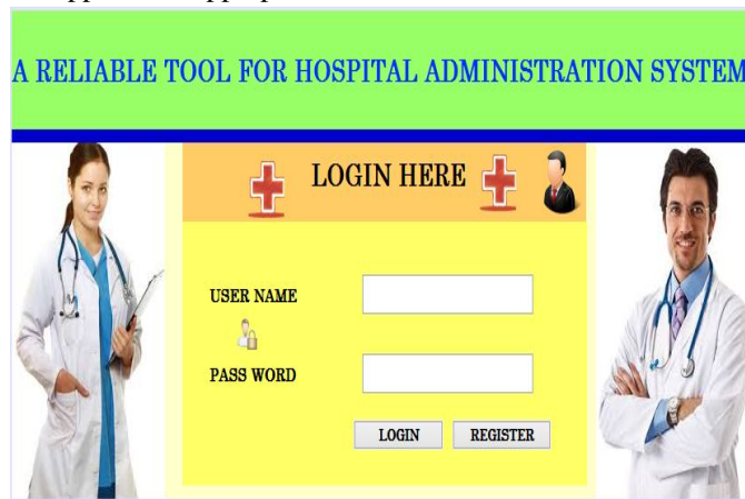
Figure1: LOGIN MODULE

Login will helps the user to access the application appprints.