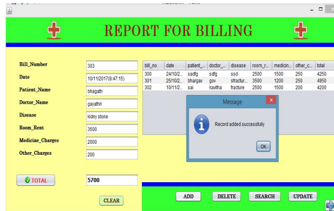
Figure 4: Reports for Patient Billing

Billing details can be stored and retrieved by the user when patient registration is done. It will show particular charges, consultation fee and total amount for that patient.