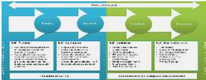
Figure 1. Benefits of SON functions

uniform distribution of load across all network elements and it leads to less network infrastructure/equipment to support a given traffic model. MLB supports HO parameter auto-tuning for SON and it needs less manual intervention by operator.