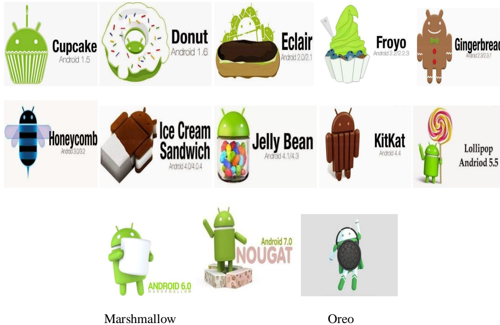
Fig: 2 Symbols of Android version[4]