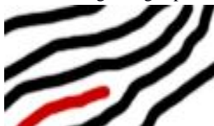
Fig. 3 Ridge Ending

Two most important minutiae are ridge termination and ridge bifurcation. Ridge termination is a point on the ridge where it terminates. Whereas the point at which a single ridge splits into two ridges is called ridge bifurcation [10,11].