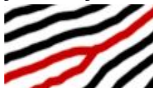
Fig. 4 Ridge Bifurcation

These minutiae of fingerprints of a human have sufficient details. We can use these non-trivial details as identification marks to verify the fingerprints [10].