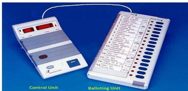
Fig. 1 Components of EVM

The following figure shows the Electronic voting machine components [4].