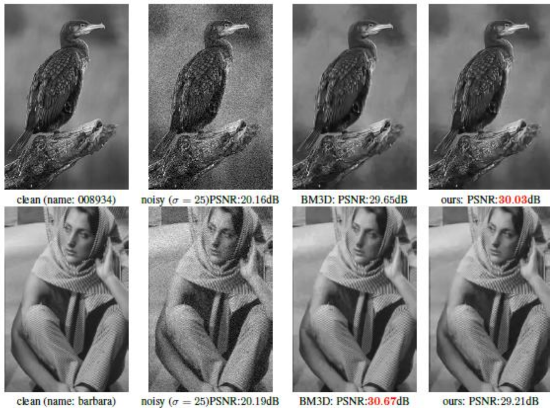
Figure 2. Our results compared to BM3D. Our method outperforms BM3D on some images (top row). On other images however, BM3D achieves much better results than our approach. The images on which BM3D is much better than our approach usually contain some kind of regular structure, such as the stripes on Barbara’s pants (bottom row).

For our experiments, we define two training sets: Small training set: The Berkeley segmentation dataset [15], containing 200 images, and Large training set: The union of the LabelMe dataset [22] (containing approximately 150,000 images) and the Berkeley segmentation dataset. Some images in the LabelMe dataset appeared a little noisy or a little blurry, so we downscaled the images in that dataset by a factor of 2 using MATLAB’s imresize function with default parameters. Test data: We define three different test sets to evaluate our approach: Standard test images: This set of 11 images contains standard images, such as “Lena” and “Barbara”, that have been used to evaluate other denoising algorithms [3], Pascal VOC 2007: We randomly selected 500 images from the Pascal VOC 2007 test set [5], and McGill: We randomly selected 500 images from the McGill dataset [17].