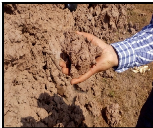
Fig. 3 IOT at dumping yard