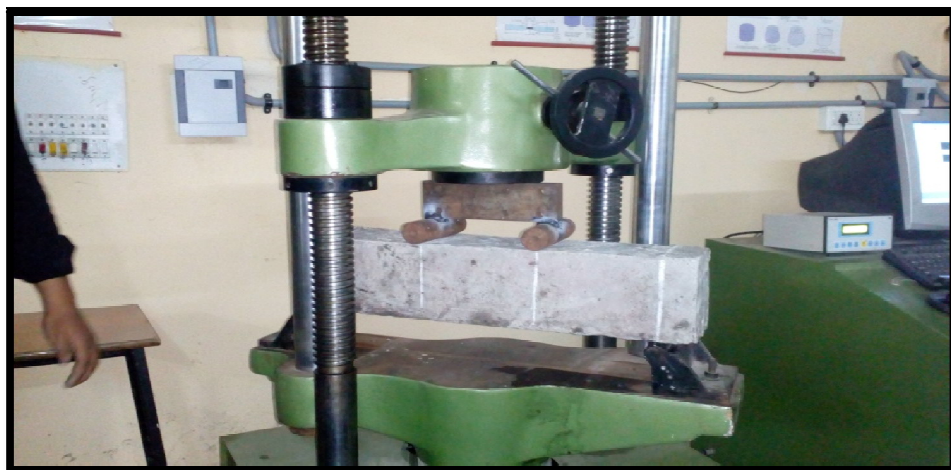
Fig. 6 Testing of beam specimen under three point loading in UTM machine