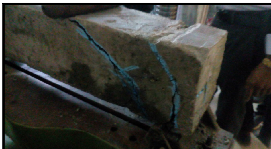
Fig. 7 Failure of beam under three point loading in UTM