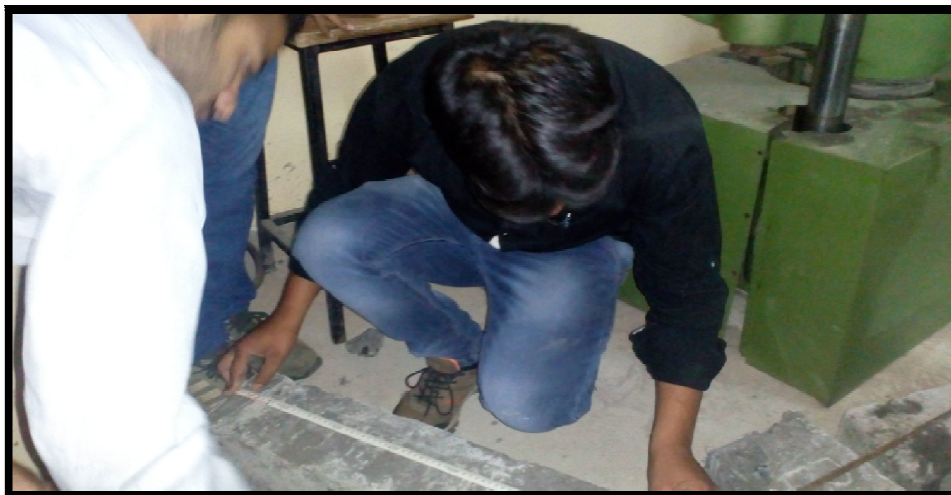
Fig. 5 Measuring and marking of beam specimen