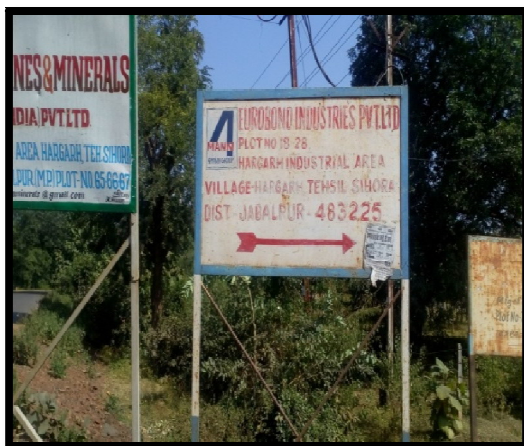
Fig. 2 Eurobond Industries Pvt. Ltd., Hargrah