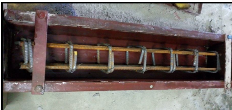
Fig.1 Reinforcement detail with mould