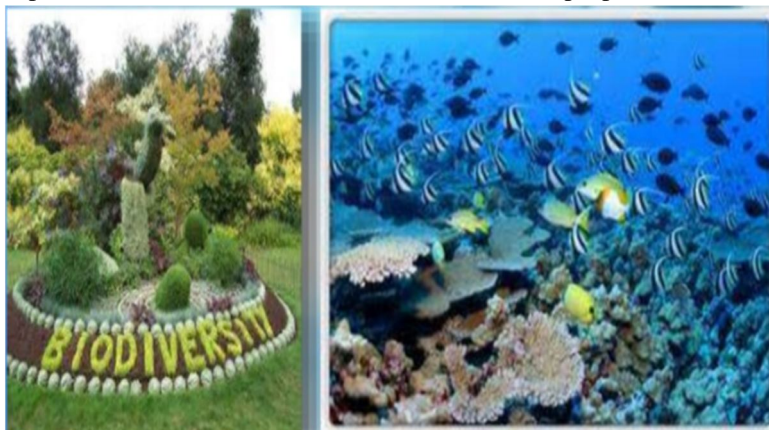
Fig 5. Biodiversity Conservation