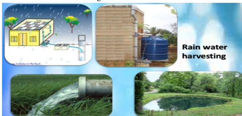
Fig4. Water Conservation

Tips regarding safeguard water: Avoid leakage of water from the taps especially when you brush your teeth or wash clothes. Another method to conserve water is Rainwater Harvesting.