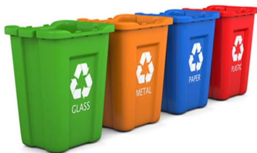
Fig7. Segregation of different products

Several surveys are carried out by which importance of recycling wastes is recognized by Government and non-government agencies in the country. However, the methodology for safe recycling of waste has not been standardized. 7 %-15% of the waste is recycled revealed by studies. Problems of waste or garbage gets easily solved if recycling can be done in a proper manner. Initiative in segregation and recycling of waste (EXNORA International in Chennai recycles a large part of the waste that is collected) have taken by a large number of NGOs (Non-Governmental Organizations) and private sector enterprises at the community level. It is being used for composting, making pellets to be used in gasifiers, etc. Plastics are sold to the factories that reuse them.