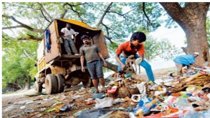
Fig1. Solid waste management in India

The urban population as per 2001 census is 285 million out of 1027 million overall population in India. The waste generated per capita is increasing by 1.3% per annum and with increasing urban population by 3-3.5% per annum, the increase in solid waste has accounted for about 5% every year. This accounts for 42.0 million tons of municipal waste generated per annum at present. Municipal authorities are responsible for implementing the strategies and developing the infrastructure for collection, storage, segregation, transportation, processing and disposal of municipal solid waste. The first city to develop Solid Waste Management (SWM) is Chandigarh. The present status of Solid Waste Management in India is poor because the best and most efficient methods for waste treatment have still not been developed. Lack of trained personnel in this field, undeveloped technology, insufficient budget and poor monitoring of government finance regulatory authority are the major barriers to achieving an efficient solid waste management in India.