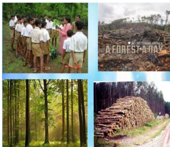
Fig6. Forest Conservation