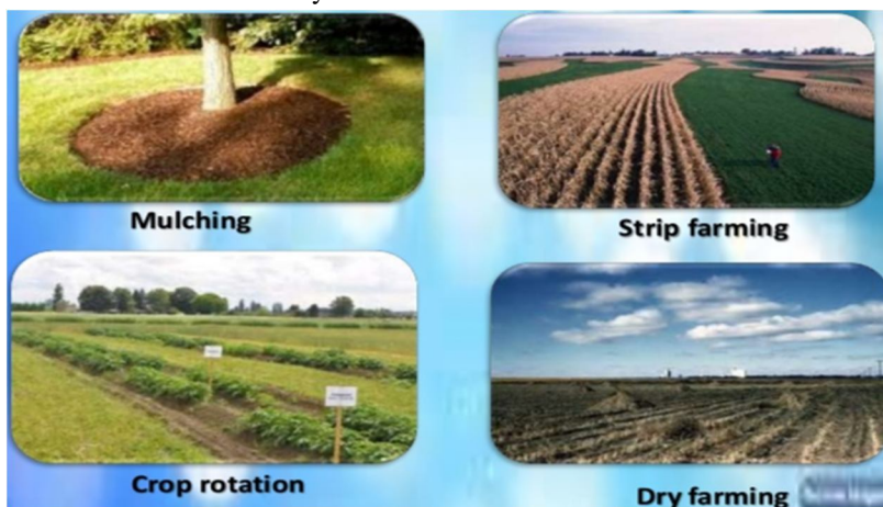
Fig3. Soil Conservation