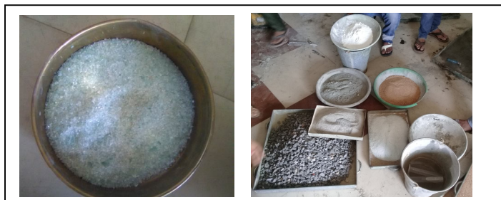
Fig. 1. Waste crushed glass and concrete ingredients used in the mixes