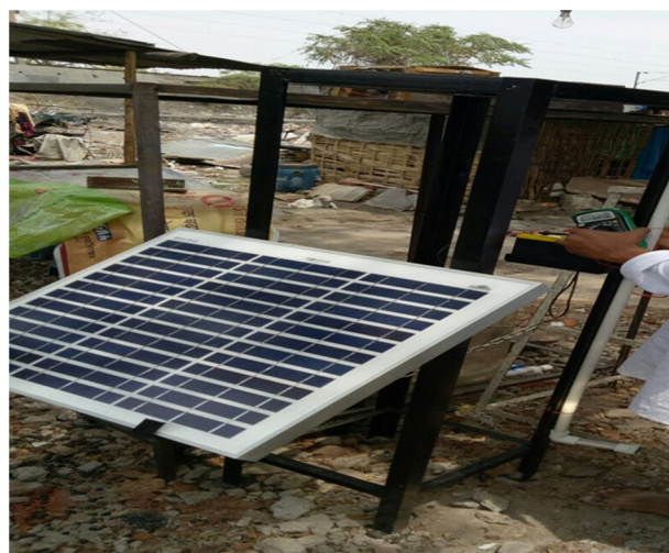
Fig.2: Photographic view of Solar Water Pumping System for Domestic Purpose.