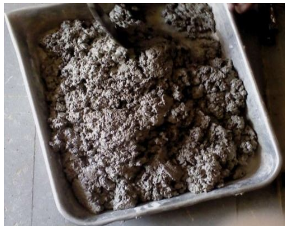
Figure 1 Mixed GPC