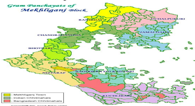
Fig.3.Map of Mekhliganj Block (Not to scale)

The Mathabhanga block I and Mekhliganj Block of Mathabhanga subdivision of Coochbehar district were purposively selected for the study area because of commercial cultivation of vegetables and nearness to main markets.