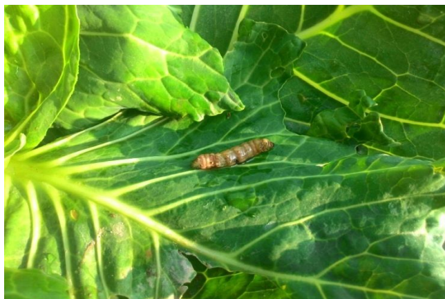
Fig.4. Invasion of insect in the cabbage