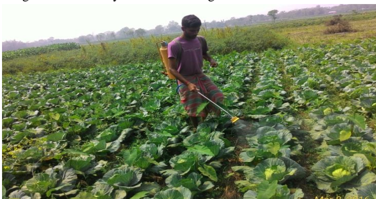
Fig.5. Unsafe application of pesticide.