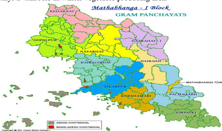
Fig.2.Map of Mathabhanga Block I(Not to scale)

The community development block Mathabhanga block-I(26°17'28"N 89°13'53"E.) of Mathabhanga sadar subdivision and and Mekhliganj (26°21'N 88°55'E.)Block of Mekhliganj sadar subdivision is situated in the Coochbehar district. Due to high rainfall and high humidity, there is diseased trouble of vegetable cultivation. Total cultivated area is 2, 58,296 ha. Net cultivated area is 2, 48,144 ha and gross cultivated area is 5, 47,108 ha in Coochbehar district. The cropping intensity for the district is 204%. Total no. of farmers are occupied in cultivation is approx 3, 70,000 in the district. The geological formation is the alluvium of recent times deposited by Tista and Mahananda rivers. The Climate is humid to sub-humid. The length of moisture availability (LGP) ranges between 270-300 days in a year[4] The principal crops are Paddy, Jute, Tobacco and Vegetables. The two blocks Mathabhanga block-I and Mekhliganj block plays a vital role as winter vegetable producing area.