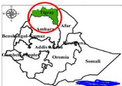
Fig. 1: Tigray state map [9]

Tigray state is located in the northern part of Ethiopia. It's bordered by Eritrea to north, Sudan to the west, Afar state to the east, and Amhara state to the south and southwest. It has difficult terrain condition or mountainous areas. In the state the construction sector is good. But there are many challenges that retard it. Thus challenges are quality (K.S. Shobana and D. Ambika, 2016) [8] , cost overrun, time overrun, budget short fall, imported material dependency, change regulations, contractor in competencies etc (Ibrahim M. and Nabil D., 2013 [3] , Anyanwu C. et al., 2017 [4] , Fetene N., 2008 [5] , M. Abubeker J., 2015 [7] ), to solve these problems the government take initiatives, but it is unable to solve it because the measures are not based on concrete study and luck of sustainability. Most of the area has good soil strength any infrastructure can be long last without any failure. Most of the challenges faced to construction around the world are also challenge for Tigray construction.