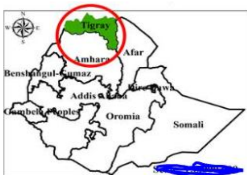
Fig. 1: Tigray state map [9]

Tigray state is located in the northern part of Ethiopia. It's bordered by Eritrea to north, Sudan to the west, Afar state to the east, and Amhara state to the south and southwest. It has difficult terrain condition or mountainous areas. In the state the construction sector is good. But there are many challenges that retard it. Thus challenges are quality (K.S. Shobana and D. Ambika, 2016) [8] , cost overrun, time overrun, budget short fall, imported material dependency, change regulations, contractor in competencies etc (Ibrahim M. and Nabil D., 2013 [3] , Anyanwu C. et al., 2017 [4] , Fetene N., 2008 [5] , M. Abubeker J., 2015 [7] ), to solve these problems the government take initiatives, but it is unable to solve it because the measures are not based on concrete study and luck of sustainability. Most of the area has good soil strength any infrastructure can be long last without any failure. Most of the challenges faced to construction around the world are also challenge for Tigray construction.