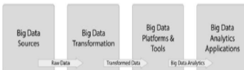
Figure 1.2 Conceptual Architecture of Big Data Analytics

Notions of volume, variety and velocity are easily understood unlike the other properties. Big data without veracity will lead to incorrect inferences being drawn. Data in and of itself has no value. Unless the data is of some worth to someone there is no meaning on focusing on any other aspect of data. Failure to understand the variable nature of data will lead inferences which will be short lived. Big data without validity is worthless. Data from different sources need to be brought together such that they are visible to the technology stack which forms Big Data. Viability is significance in determining the relevance and practicality of data before progressing into further modeling and analysis. Figure 1.2 illustrates the conceptual architecture of big data analytics.