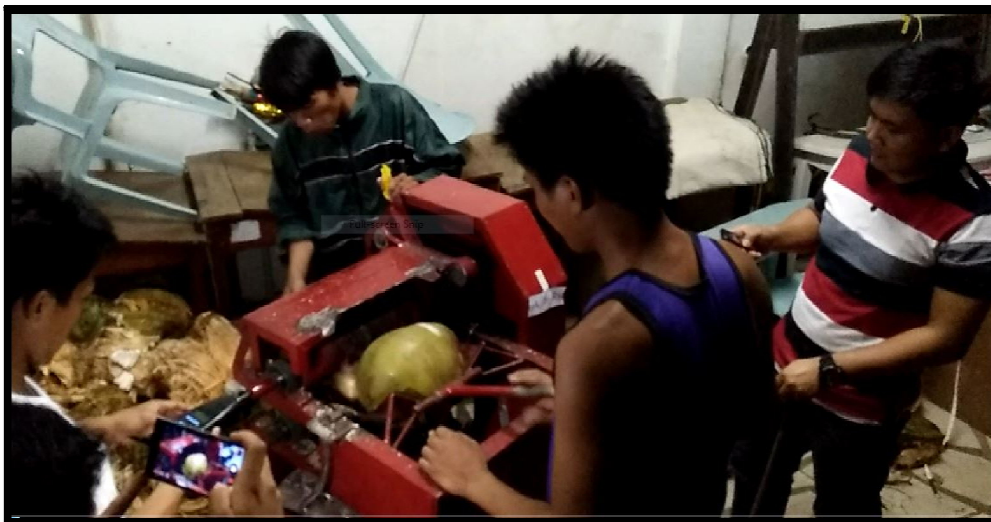
Figure 2. Actual dehusking operations of the machine during the final tests conducted by the researchers