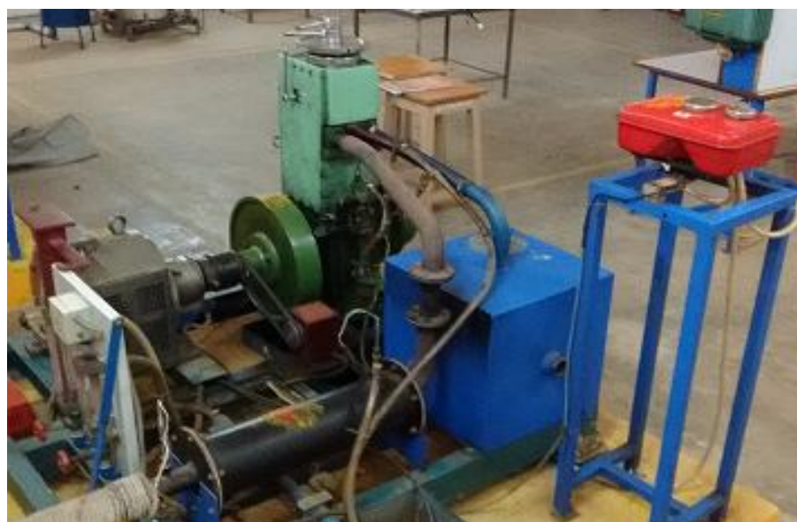
Fig. 3. Photographic View of Experimental Setup