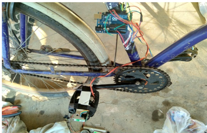
Fig 3.Experimental Setup