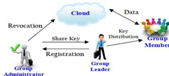
Figure 3. Proposed System Architecture

To achieve the reliable and scalable in SMONA, in this paper we are presenting the new framework for SMONA. In this method we are further presenting how we are managing the risks like failure of group manager by increasing the number of backup group manager, hanging of group manager in case number of requests more by sharing the workload in multiple group managers. This method claims required efficiency, scalability and most importantly reliability.