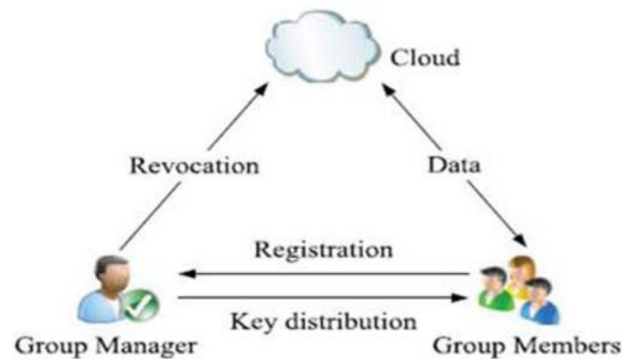
Fig.2. System Model

Therefore practically in all cases MONA outperforms the existing methods.