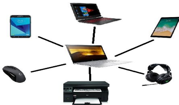
Fig. 1 PAN Network