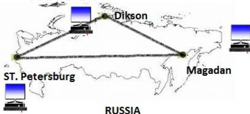
Fig. 4 WAN Network

transmission lines. Due to large area covered in this network leads to propagation delay, low data rate problems. Example: Bank with different branch offices in different cities. In the following diagram WAN connects the three branch offices of Diskon, St. Petersburg, Magadan in Russia..[1][2][3][8][18][10]