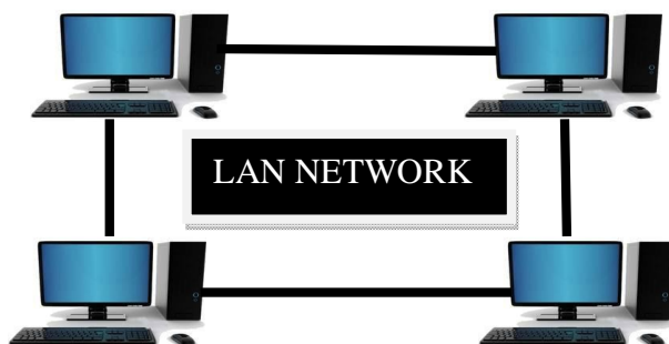
Fig. 2 LAN Network