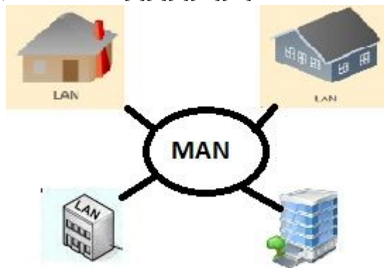
Fig. 3 MAN Network

MAN is a computer network that merges different networks situated in various buildings into a single network. The range of this network lies between 5 to 50 kilometres. The geographical area of MAN lies between LAN and WAN i.e. it covers more area than LAN but less than WAN. MAN network can be wired as well as wireless.[8] It connects various LAN's covering the entire city. Various computers in wired MAN can be connected using different communication mediums such as: a twisted pair, optical cables and in wireless MAN with the help of radio waves etc. [12] Example of MAN network : Network between different branches of a bank in a city, cable television networks, air reservation.[1][2][3][18][14]