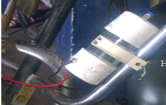
Fig1(a) ELECTROLYZING CHAMBER