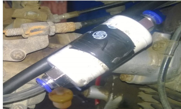
Fig1(b) MOISTURE FILTER