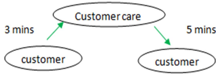
Fig. 2 VSM in construction office current map