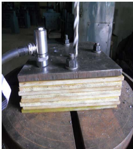
Fig 2 Experimental setup

As fig 1 show, the specimens of 210x210x5mm are prepared for glass fiber and glass fiber epoxy. Size of mild steel plate is taken as 210x210x5mm. Drill bit is used of 10mm during experiment. Fiber plate used 4-3-2-1 for experiment.fig 2 show the setup.