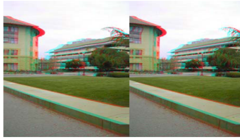
Fig. 3 (a) Anaglyph images generated using the ground-truth depth and (b) depths estimated by the proposed global method [7]

type idea. The second one is based on globally estimating the entire depth map of a query image directly from a repository of 3D images which is a set of image + depth pairs using a nearest neighbor regression type idea. This approach is built upon a key observation and an assumption. The key observation is that among millions of 3D images available on-line, there likely exist many whose 3D content matches that of the 2D input query. The key assumption is that two 3D images whose left images are photo metrically similar are likely to have similar depth fields.