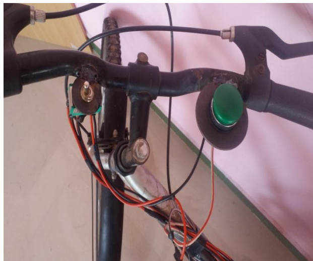
Fig. 1 Handle arrangement

Often support a portion of the rider's weight, depending on their riding position, and provide a convenient mounting place for brake levers, shift levers, bells, etc. Handle bars are attached to a bike's stem which in turn attaches to the fork. Handle bar is used to control the direction of the vehicle.