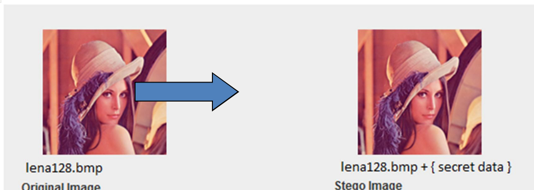
Fig: Process of Generating Stego-Image