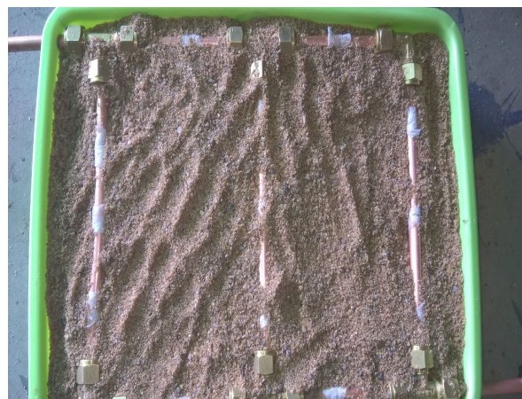
Figure 1: Set-Up of Copper pipes in Sand

The Experimental Set-up has been designed as follows consisting of copper pipes, sand, water pump and an air blower as shown in Fig(1).