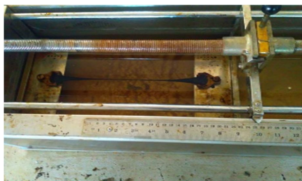
Fig. 3 ductility test