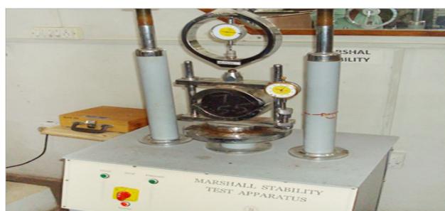
Fig. 5 flash and fire point test.

5) Flash And Fire Point Test: Bituminous material leaves out volatiles at high temperatures depending upon their grade. These volatile vapours catch fire causing a flash. The flash point is the lowest temperature at which flash occurs due to ignition of volatile vapours when a small flame is brought in contact with the vapours of a bituminous product, gradually heated under standardized condition. When bituminous material is further heated to a higher temperature, the material itself catches and continues to burn; the lowest temperature causing this is the fire point. Fire point is always higher than flash point. The flash point of a material is the lowest temperature at which vapours of a substance momentarily take fire in the form of flash. The fire point is the lowest temperature at which the material gets ignited and burns under specific conditions of test.