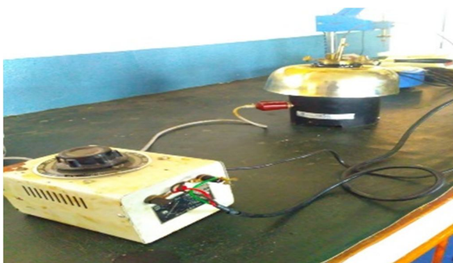
Fig. 6 marshall stability test

Based on the results obtained from the Marshall stability test of the normal bitumen and modified bitumen containing various concentrations of plastics a graph is drawn and according to the graph the maximum value gives the strength of the materials. Based on the table above the maximum strength is attained at the 5.5 % of the bitumen content.