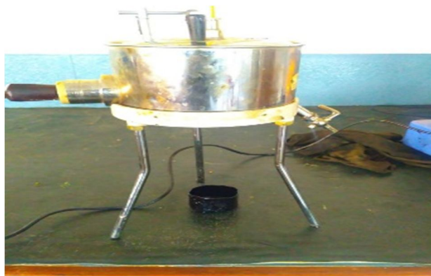
Fig. 2 viscosity test