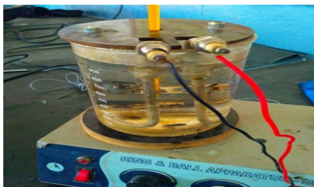
Fig. 4 softening point test.

5) Flash And Fire Point Test: Bituminous material leaves out volatiles at high temperatures depending upon their grade. These volatile vapours catch fire causing a flash. The flash point is the lowest temperature at which flash occurs due to ignition of volatile vapours when a small flame is brought in contact with the vapours of a bituminous product, gradually heated under standardized condition. When bituminous material is further heated to a higher temperature, the material itself catches and continues to burn; the lowest temperature causing this is the fire point. Fire point is always higher than flash point. The flash point of a material is the lowest temperature at which vapours of a substance momentarily take fire in the form of flash. The fire point is the lowest temperature at which the material gets ignited and burns under specific conditions of test.