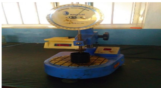
Fig.1 Penetration Test