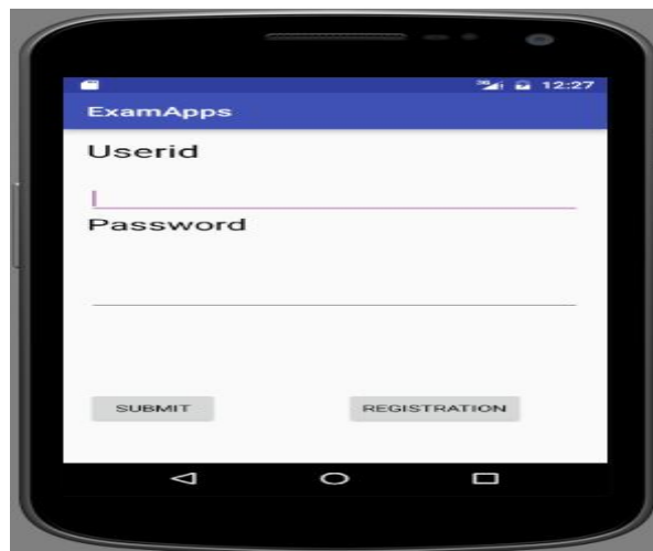
Fig 2: Module I- Login page