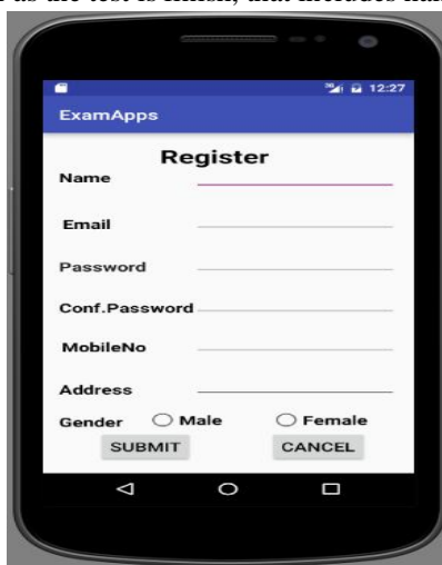
Fig 3:ModuleII- Registration page

“Exam Android Application” is designed for Educational Institutes (like schools, universities, training centers).The app will handles all the operations, and generates reports as soon as the test is finish, that includes name, mark, time spent to solve exam.