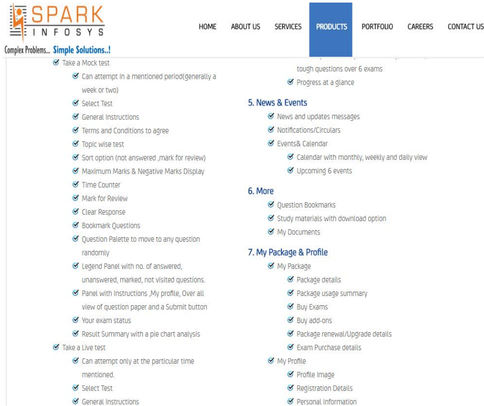
Fig 1.3 Exam user selects the MCQ