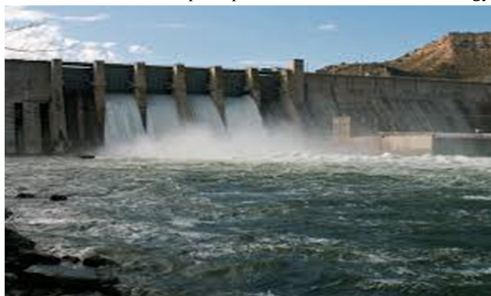
Figure 2. Hydropower plant

Hydropower is the technology to generate the power or electricity by constructing dam or barrage across the river [5]. Its principle of operation is very simple. Water is stored at higher level and then it flows out at a higher pressure to the downward through the penstocks which rotates the turbines so that it follows the principal of conversion of kinetic energy into mechanical energy [6].