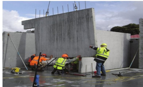
(Fig-3 Panel Building System)