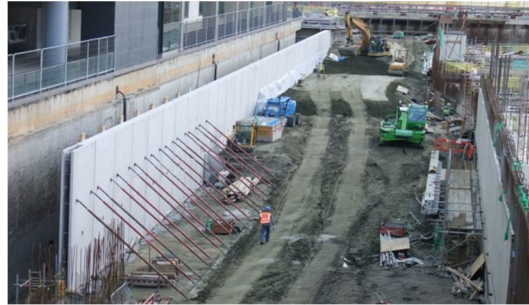
(Fig-7 Twin Wall)