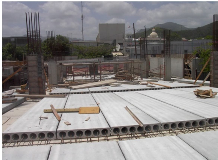
(Fig-6 Hollow core)