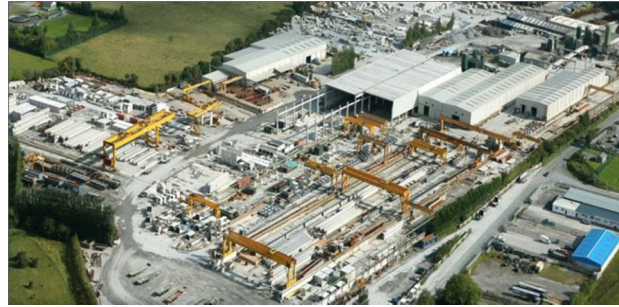
(Fig-2 off site Manufacturing)