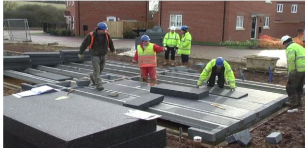
(Fig-5 Jet Floor)