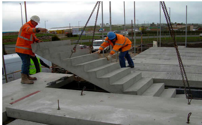
(Fig-8 Stair case)