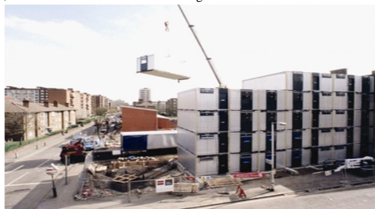
(Fig-4 3D Volumetric construction)

Units are used to form the structure of the building, thereby enclosing the usable space. Typically, modular construction means that between 80 to 95 per cent of the building-come manufacturing process is completed at the factory and then delivered to the site for final assembly. This process involves connecting the completed modules to each other on site. There is no requirement for any additional supporting superstructure. Modular construction is often used on larger, more standardized schemes due to the economies of scale of many similar sized modules and the discernable benefit of reduced construction times. Prefabricated modules are often referred as pods and are factory finished internally, complete with mechanical and electrical services. Pods are available in timber frame, light-steel frame, hot rolled steel frame, concrete or GAP superstructure and are mainly used in more specialized areas that can be standardized and repeated, such as kitchens and bathrooms. Fig-4 shows 3D Volumetric construction