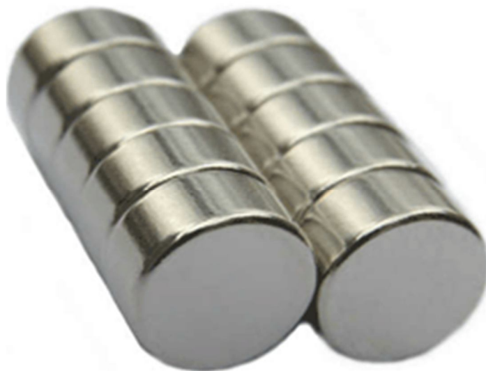
Fig 3 Super strong cylinder magnet 25x20mm Rare earth neodymium N5

Neodymium magnets have higher remanence, much higher coercivity and energy product, but often lower Curie temperature than other types. Neodymium is alloyed with terbium and dysprosium in order to preserve its magnetic properties at high temperatures[15]. The table below compares the magnetic performance of neodymium magnets with other types of permanent magnets.