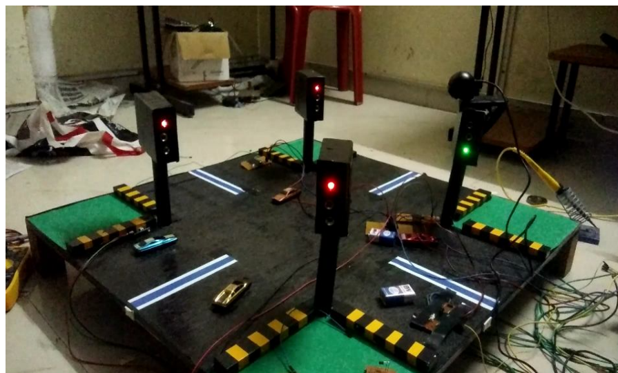
Fig.3 Prototype of Our Project