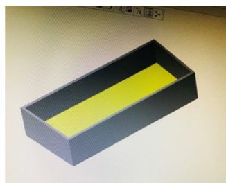
Fig. (a) Coolant collecting tank.

To overcome this problem we have fabricated a tank to collect the falling coolant and re worked On the tray to ensure that the coolant should not leak. We made some calculation shown above to know exact amount of Profit Company will get after this implementation.