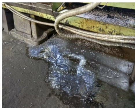
Fig. 1. Coolant wastage on lathe machine.