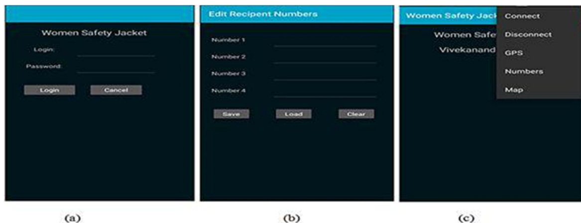
Fig.2 (a). Login & password entry (b). Entry of predefined numbers (c). Connection & disconnection of Bluetooth via app