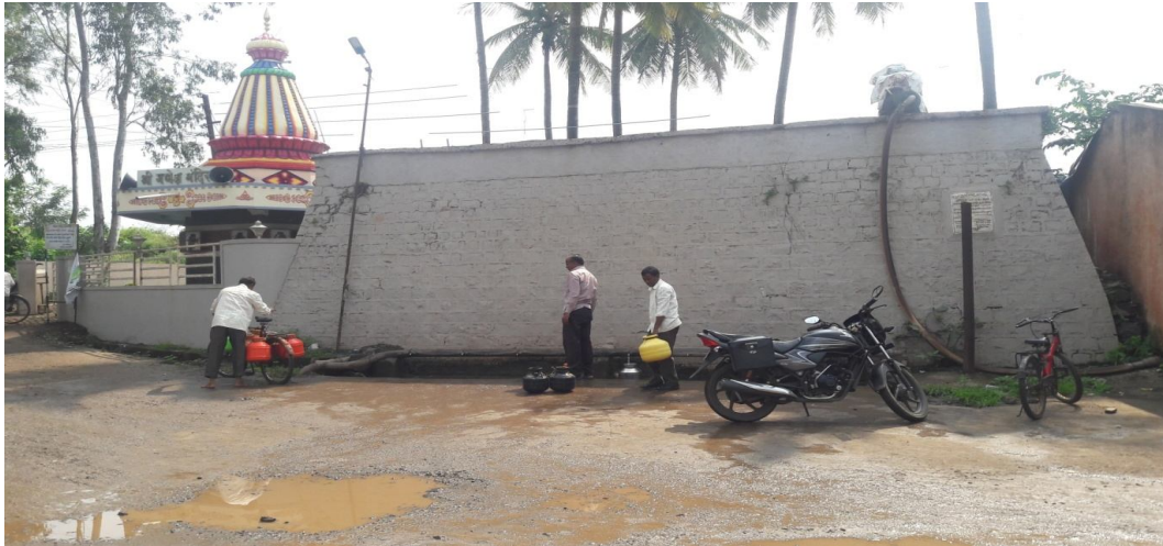
FIG.1.1 Present Status Of Atigre Village Drinking Water Supply

At present condition there is no facility of the water treatment. no facility of testing the water, to check that weather it is potable or not.