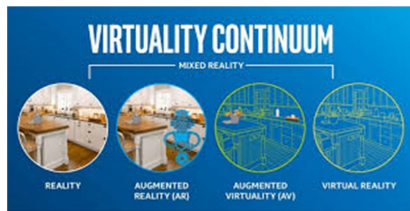
Fig. 1 Reality – Virtuality Continuum

In 1990, the former Boeing researcher THOMAS P. CAUDELL gives the concept of 'Augmented Reality' then more researches are going on this technology such as in 2013, Google takes an open test for Google Glass augmented reality. The technology is growing fast in every sector over the world. The basic goal of system is to enhance the user's perception of and interaction with the real world and build up the real world with 3D virtual objects that appear to coincide in the same space as the real world. Augmented Reality aims at simplifying the user's life by bringing virtual information not only in the existing environment, but also to any indirect view of the real-world environment, such as live-video stream. Examples of AR such as: Google Glasses, Head Mounted Display (HMD), Hololens.