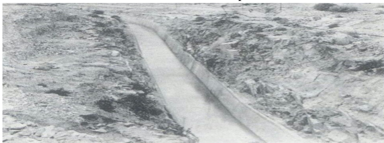
Fig 2. Cement Concrete Canal Lining