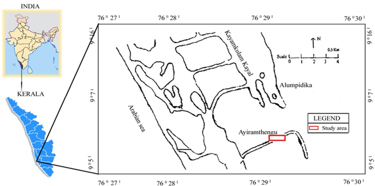
Fig. 1. Map of Ayiranthengu mangrove ecosystem