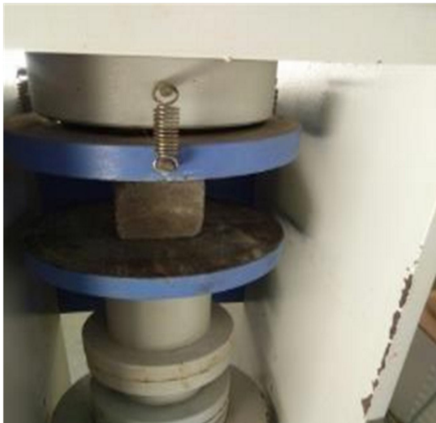
Compression test of a cube Calculations :

1) Compressive Strength Of Concrete Cube : The compression test of cube was determined by CTM equipment.