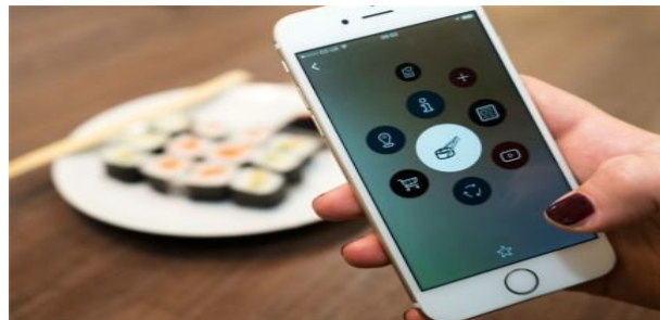
Fig 1. Blippar

The AR is growing at a very fast rate in education sector. With the help of this technology, the education models will help students and teachers to understand the topic well. AR acts as a fun element in education. Through various ways it grants students digital information to understand any subject in an easy, interactive and efficient manner, thus making complex information easier to understand. Thus the student's experience is highly visual, pictorial and interactive. AR changes the learning environment of children and it also ignites their mind to further discover all the things in the world. As shown in the fig below the blippar app visualizes topics and objects from printed material and turning it into 3D interactive models.