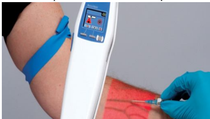
Fig 2. AccuVein : used to locate veins

Holo Eye anatomy app is used to study the human eye structure in detail and works exclusively on the Microsoft HoloLens. Eye Decide is simple app which is used to educate patients on the disorder of their eyes.