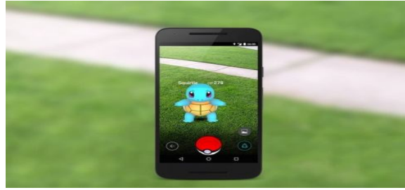
Fig 3. Pokémon Go Game