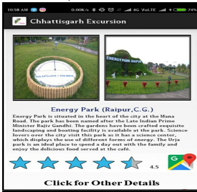
Figure: 5. Energy Park