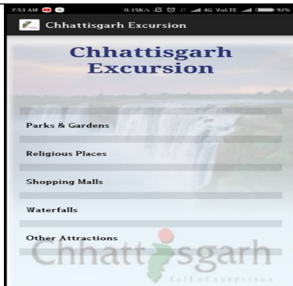
Figure: 2. Home Page