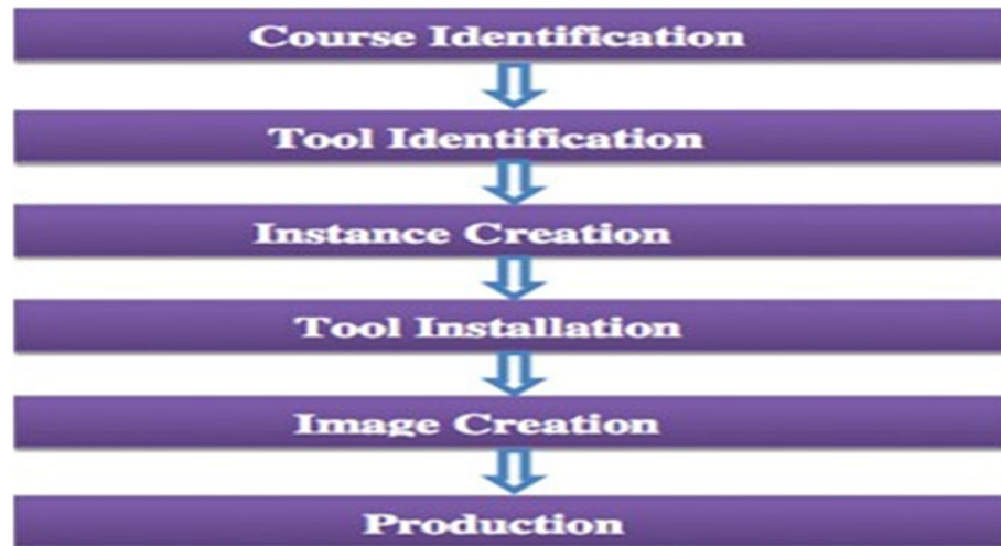
Figure-2. Guidelines in implementing software engineering tools on cloud [1]

Another issue featured is the readiness to adjust this new innovation. From the aggregate audit of past study took care of with three colleges which are Asia Pacific University of Technology and Innovation Malaysia, University Technology Malaysia and University Malaya Malaysia, exchange of results acquired where software engineering undergraduates confront trouble of similarity, accessibility and permitting of the software while addresses are worry by the accessibility of the labs for situations for immense classes and unmanageable gatherings. Moreover, this paper gives a rule in executing the software engineering instrument in cloud with depictions in Figure 2 as underneath.