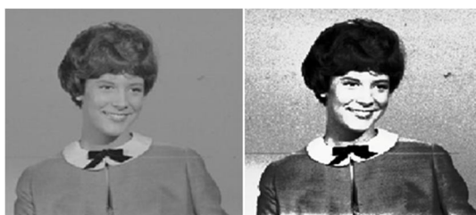
Fig 4. Original Image & Output Image for BBHE

BBHE technique is used for preserving brightness of an image. One of the most important characteristics of an image is brightness preservation. This method divides the image's histogram into independently two equalized parts. So the intensities are arranged equal as well. The major limitation of histogram equalization is the brightness of given image has been changed because of flattening property of histogram equalization [13]. So that histogram equalization is hardly utilized in applications such as consumer electronic products Television and other products where preserving the original brightness may be necessary to reduce unnecessary visual corrosion.