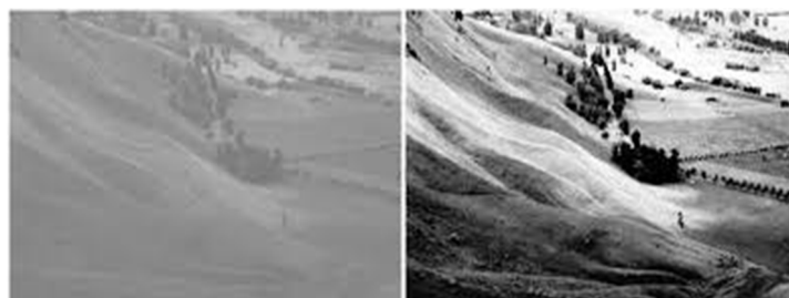
Fig7. Original Image Output Image for CE

Image enhancement techniques play an important role in many applications of digital image processing where the quality of images in terms of contrast and visual appearance is essential for human interpretation. Contrast is one of the important factors in any kind of subjective valuation of digital image quality. The feature contrast is created by taking the variance in luminance reflected from two adjacent surfaces. In other words, contrast is the variance in the visual factors or properties that makes an object separable from other objects and the background. The contrast in visual perception, is determined by the difference in brightness, colour and of the object with other objects. Human visual system is more sensitive to contrast than the absolute luminance; so that, human can perceive the world similarly regardless of the considerable changes in illumination conditions. Most of the algorithms for obtaining contrast enhancement have been proposed and developed, they are applied to the problems in image processing. This technique automatically increases the brightness of digital images which appear as dark, poor in clarity. Apply appropriate tone correction to deliver improved quality and clarity [17]. This technique plays an important role for most of the medical applications. The result of CE is shown in below fig 7.