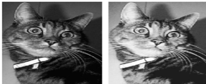
Fig 5. Original Image Output Image for AHE

minmax windowing method. Thus it reduces the amount of noise in regions of the image. And also AHE have the ability for improving the contrast of grayscale and color image. The results of AHE is shown in fig 5.