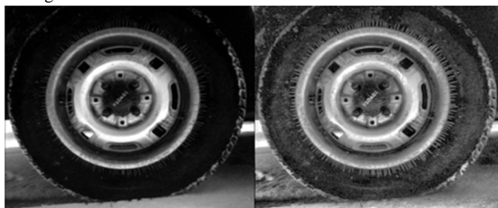
Fig6. Original Image Output Image for CLAHE

Contrast-limited adaptive histogram equalization (CLAHE) is the technique used for enhancing the contrast in the grayscale image. This technique applies on small regions in the image, called tiles, instead of the entire image [16]. Each tile's contrast is enhanced, there by the histogram of the output region roughly matches the histogram which is specified by the distribution parameter. The neighbouring tiles are finally combined by using bilinear interpolation in order to eliminate artificially induced boundaries. Particularly in homogeneous areas, the contrast of the image can be restricted to circumvent amplifying any noise. The sample output of this technique is shown in fig 6.