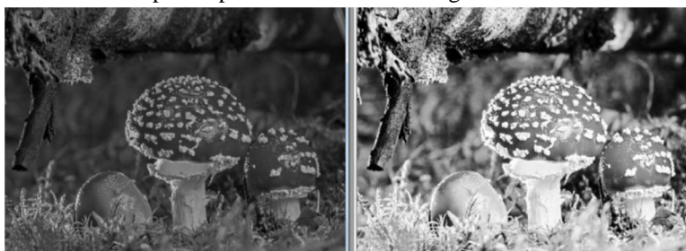
Fig 3. Original Image & Output Image for HE

Histogram equalization is a popular image enhancement technique for better contrast and appearance of images. Suppose we have an image which is predominantly dark. Then its histogram would be skewed towards the lower end of the grey scale and all the image detail is compressed into the dark end of the histogram [12]. Image becomes clear by draw out the grey levels at the dark end to generate a more uniformly distributed histogram. Histogram equalization generates image with a consistent histogram by finding a grey scale transformation function. The sample output of HE is shown in fig 3.