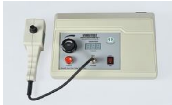
Fig 5: Biothesiometer

at which patient cannot feel the vibration. The same process was then applied to record the measurement on the upper limb. An upper limb with joints of the middle finger, fingertip, wrist, and elbow were tested. The participant was prone during the testing procedure and cannot able to see the biothesiometer knob as shown in figure 5. [21]