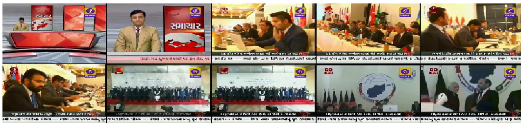
Figure 2: Key Frames determining sharp 'cut'

number of nonzero singular values. With Low Ranks of matrix, we can separate out non-similar frames. Which ultimately gives us sharp cuts in determining shot boundary of input video.