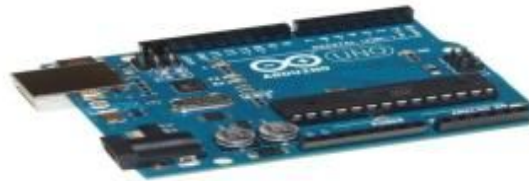
Fig: Arduino Uno