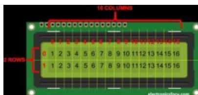
Fig: 16*2 LCD Display