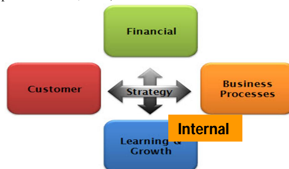
Figure (1): Balanced Scorecard perspectives

These four perspectives in numeral (1) are calculated to cover the complete of the organization's behavior, both inside and on the outdoor, in progress and prospect (Kaplan & Norton, 1996).