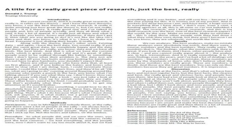
Figure 2 Textual processing