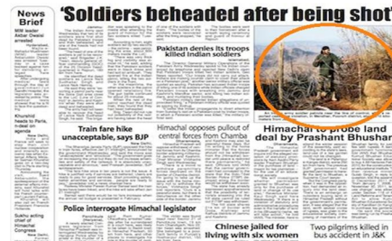
Figure 3 Graphical processing